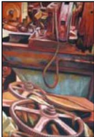
Study in Rust